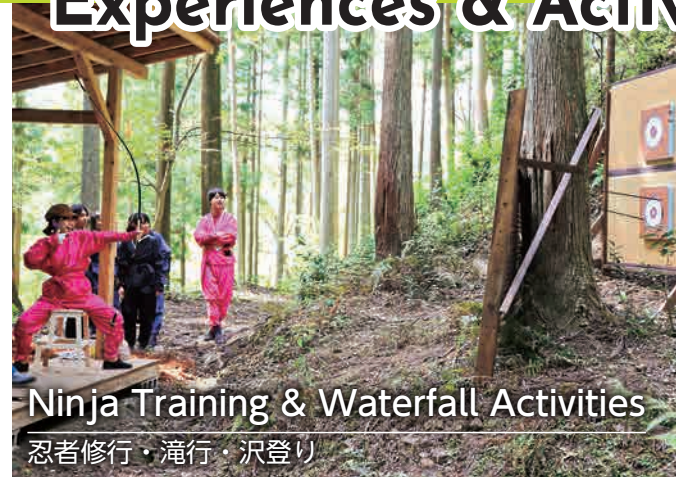
Ninja Training & Waterfall Activities