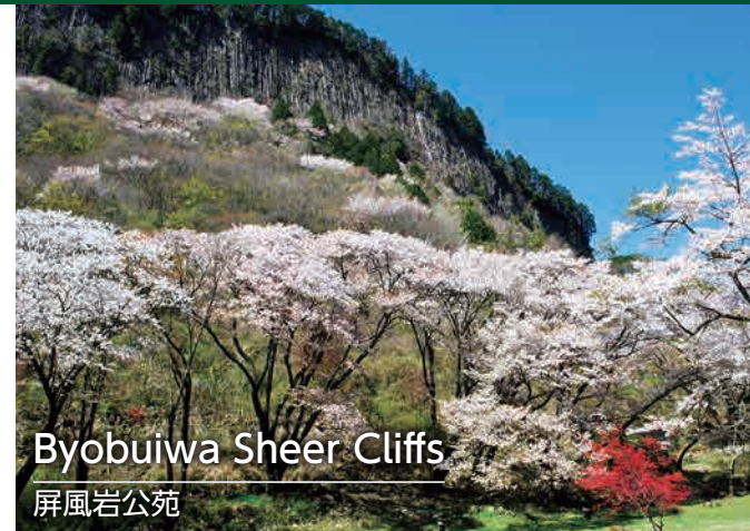
Byobuiwa Sheer Cliffs