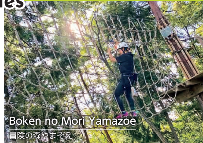
Boken no Mori Yamazoe

Reservations are required for all activities. Please contact East Nara Nabari Tourism office for booking.