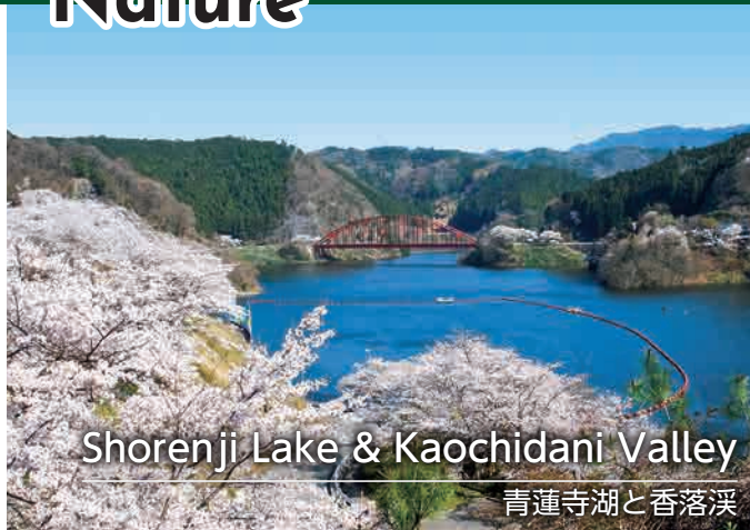
Shorenji Lake & Kaochidani Valley