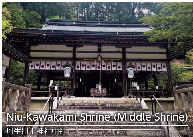
Niu-Kawakami Shrine (Middle Shrine)