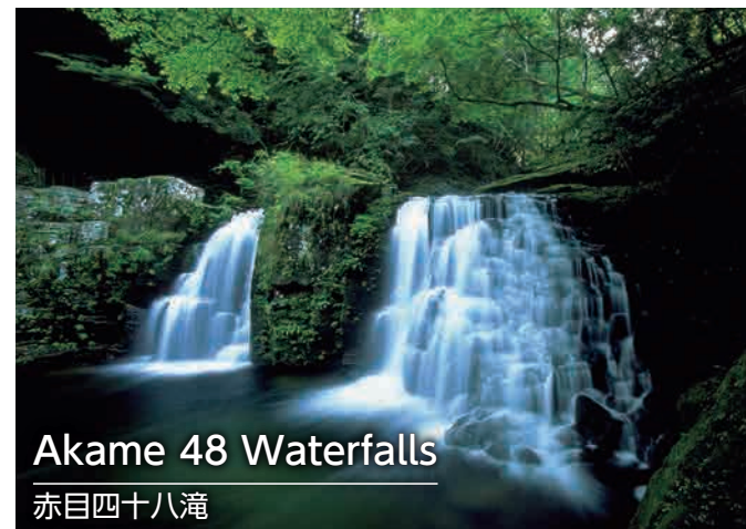
Akame 48 Waterfalls