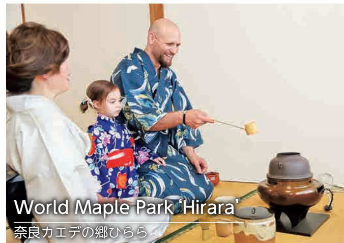
World Maple Park 'Hirara'