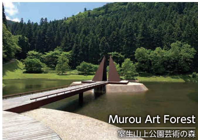
Murou Art Forest

MAPCODE 342 100 393 *64 342 158 758 *52 (Parking)