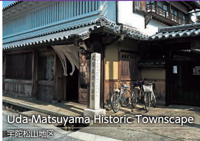
Uda-Matsuyama Historic Townscape