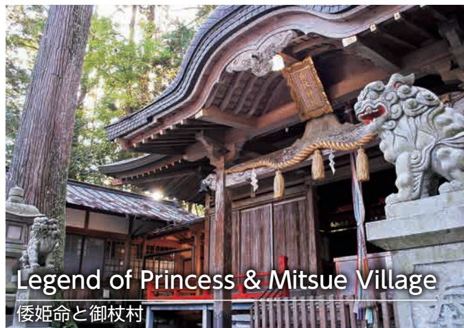
Legend of Princess & Mitsue Village