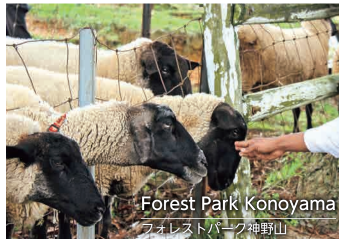
Forest Park Konoyama

MAPCODE 266 055 058 *31 266 026 367 *52 (Parking)